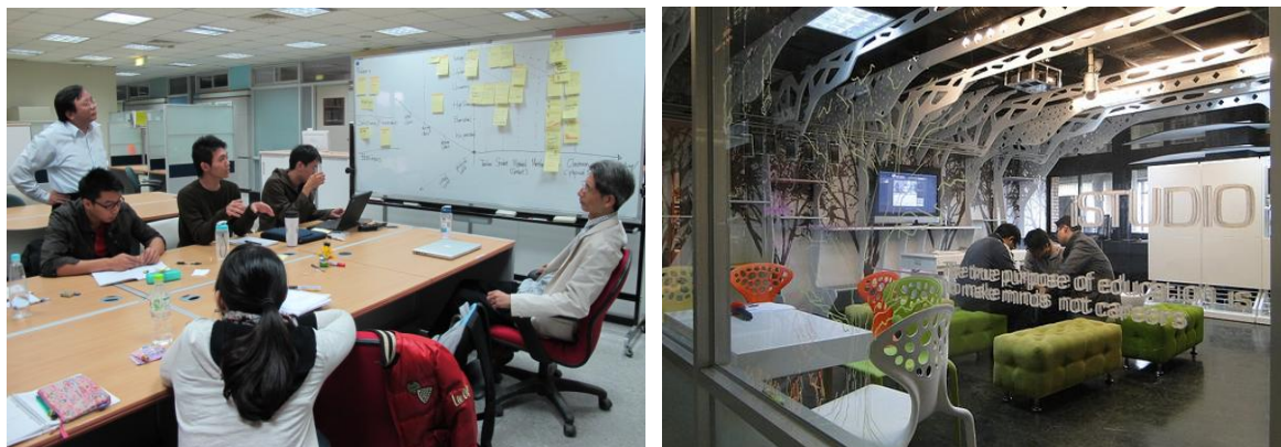
Figure 1 Future classroom brainstorming

As a matter of fact, many researchers have found that communication among learners can enhance performance for all learners in the scenario of online learning. Fostering interaction among people who use online learning environments does indeed support deep learning and a high level of engagement in practice [5]. The more interactive the activities that emerge from the class, the greater the learners' motivation is. Learners will also focus their attention on learning and have more engagement in the classroom. At the same time, cooperative learning among the learners and interactive teaching by the teacher are very effective [6]. Therefore, communication and participation are two of the most important elements of classroom interaction.