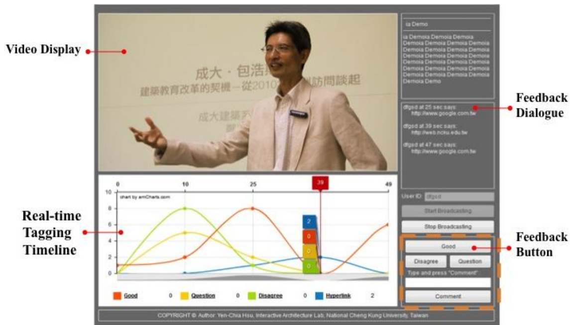
Figure 2 Interface of the interactive social learning platform

video content. It is clear that the teaching and learning process can be transformed from a limited one-way interaction into an open multiple-way interaction.