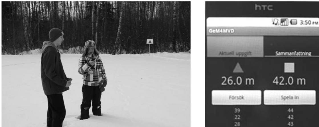
Figure 2: Children in the outdoor activity and the display of the mobile device.

The standing markers for the reference points were placed 58 meters apart and could be readily identified from a large distance (Fig. 2, left pane). A suggested starting point was marked with a pole and located 46 meters from each of the markers (Fig. 1, left pane). A total of ten goal points, corresponding to ten different subtasks, were chosen to provide variation between longer and shorter distances. The first goal point required the students to coordinate themselves with respect to the distances 26 m and 42 m (Fig. 1 & Fig. 2).