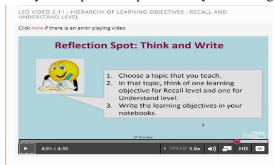
Figure 1. Reflection Spot in an LeD Video

Each week will contain a set of Learning Dialogue (LeD) videos to provide information to the participants about the concepts being discussed in the respective week. The LeD videos have 'pause points' (Reflection Spot) within it that required participants to pause the video and think about a question posed at that moment (See fig below). The participants can write the answer in their own notebooks/text document, but they are expected to proceed only after doing this reflection.