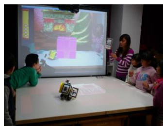
Figure 2. Digital Learning Playground