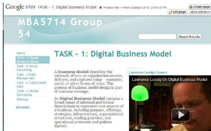
Figure 2: Google Sites Example for a Student Group

Figure 2 shows the Google Sites interface for one of the groups. At the bottom of each page in the wikis, comments and file attachments can be added.