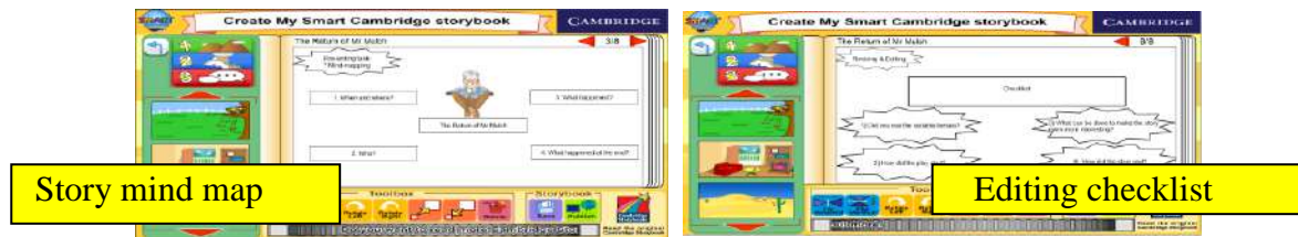
Figure 3 Online scaffold examples

Different levels of scaffoldings will be also given online to guide students through the writing process. Figure 3 demonstrates sample scaffoldings including story mind maps and editing checklists, these features are available within the writing environment. Students could create and edit multiple versions of their own storybooks.