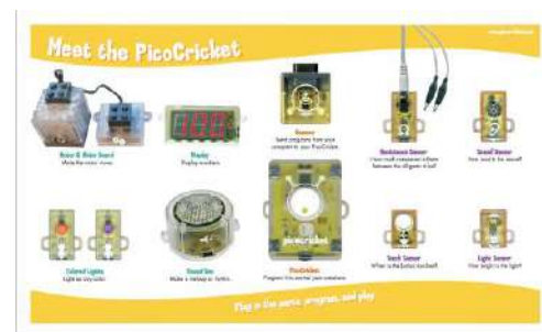
[Figure 2] Picocricket Hardware