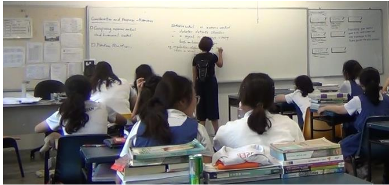
Figure 2. Back view from one of the cameras capturing teacher-based instruction in a classroom. The teacher was wearing an eye-tracking device that drew power from a backpack.