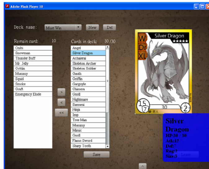
Figure 1. Silver Dragon, one of the most powerful 5-star card currently in the game.

Figure 1 below shows a five-star card – Silver Dragon. It has 30 Health Points and has very high Attacking Power (i.e., 15) and its Defending is also high enough (i.e., 7) when it is placed as defending position – a card cannot attack while at defending position and cannot defend itself while at attacking position. Silver Dragon is an extra-large (XL) Avatar card which means its dead will make its player lose a lot of life points. As a dragon can fly, doesn't like most of Avatar cards, its attacking range is 2.