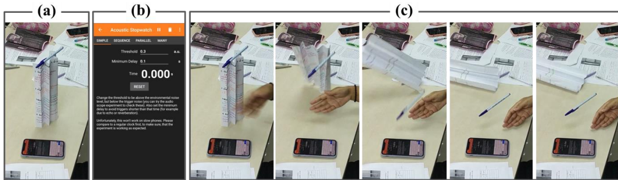
Figure 1. Experimental Method. (a) Setting the object's height. (b) Phyphox application with a timer mode and an acoustic stopwatch feature to measure the time spent free-falling. (c) Time series images capture the falling event.