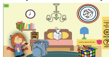
Figure 32. Level 1: Bedroom (Cube) sample.

Once the game determined which path the player takes, the map will appear for the player to proceed in the first level. In each location, the player should find the specific shapes needed to surpass a certain level. When an object is clicked and dragged to the backpack, the object will zoom in and rotate to emphasize the object's 3D shape for the visualization of the player.