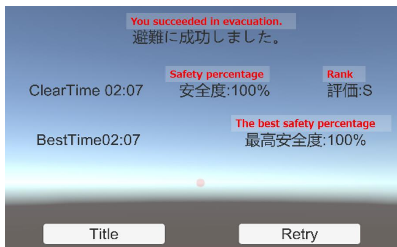
Figure 40. The Result Screen

When learners start the learning game, the screen shown in Figure 38 but without an alert will appear. The learning game starts at the students' lounge which is on the second floor of the building No.5 (Left side of Figure 37). First, learners hide under a table following the instruction until the tremors of the earthquake stopped. If they do not hide this time, the safety percentage will decrease. After stopping the tremors of the earthquake, learners start the evacuation. They are going to find doors to the outside, which are on the first floor of the building. If they can find one of them and can get out of the building, the evacuation is a success. As mentioned in chapter 2, the safety percentage will decrease if they run or go near windows, and the dangerous action count will increase, and the learning game will restart if they get closer to an elevator. The game is over if the safety percentage becomes 0% or if they do dangerous actions three times. If they succeeded in an evacuation, the result screen (Figure 40) will appear, and learners can see an evaluation. The best score is updated if the score of the learning game is higher than the current best score.