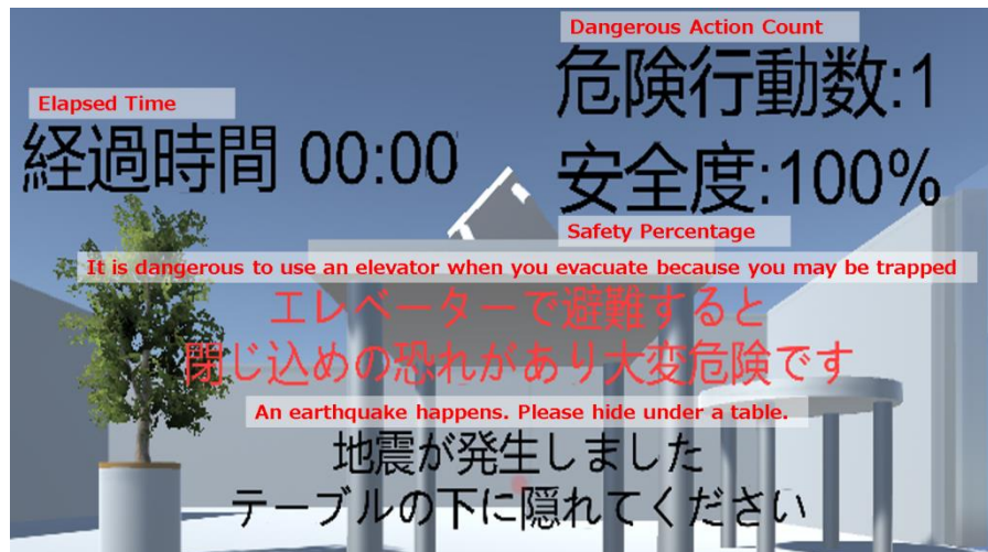
Figure 38. The ScreenShot after Restarting

as a dangerous action in the learning game. Thus, when learners get closer to an elevator, the dangerous action count will increase, and the learning game will restart. The game will be over when the count becomes three.