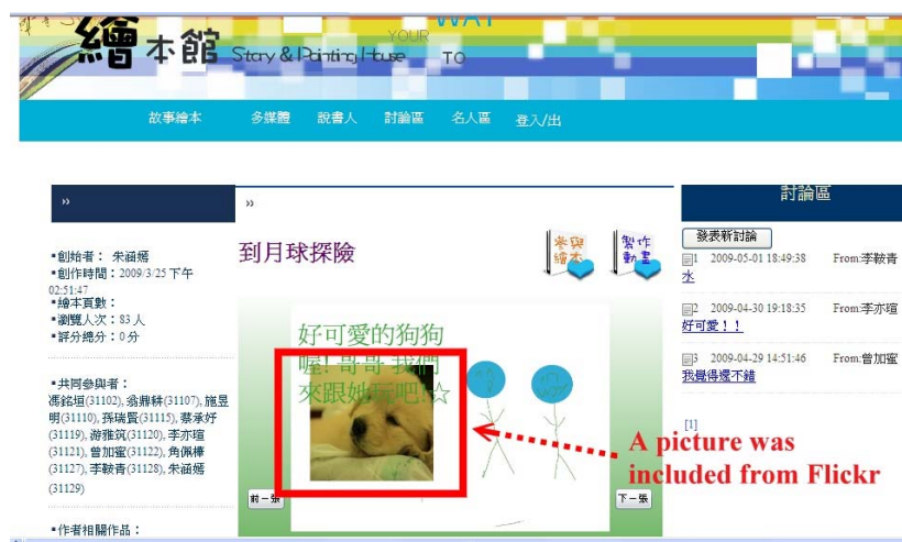
Figure 2. An image was inserted into a picture book from a open resource website: Flickr