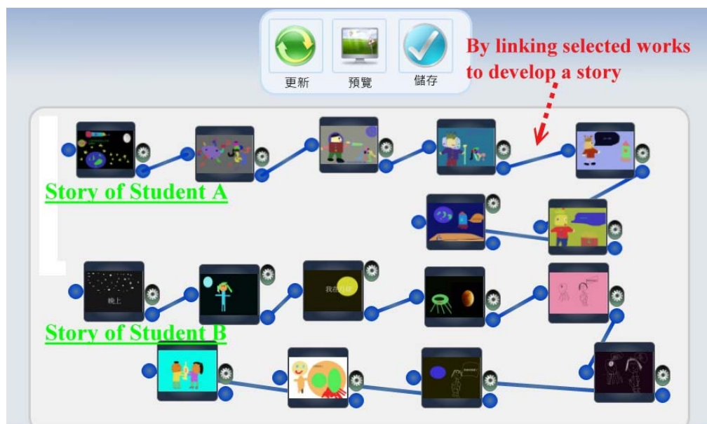
Figure 3. Participant created a new story plot by linking selected creative works

new story plot by linking selected works (Figure 3). The process of deriving and remixing would be iterative in the collaborative duration of creative activity. In other words, participants can interpret and organize the representation of a work in their own way by orchestrating a shared pool of creative works. Contributors in such a mechanism may be more willing to help each other and engaging in the collaborative creative activities.